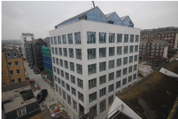
Proposed scheme as at 24 March 2021 (office building in foreground)