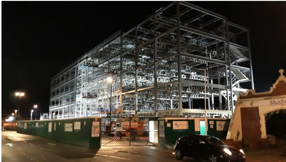
Teville Gate House Construction 12/12/2019